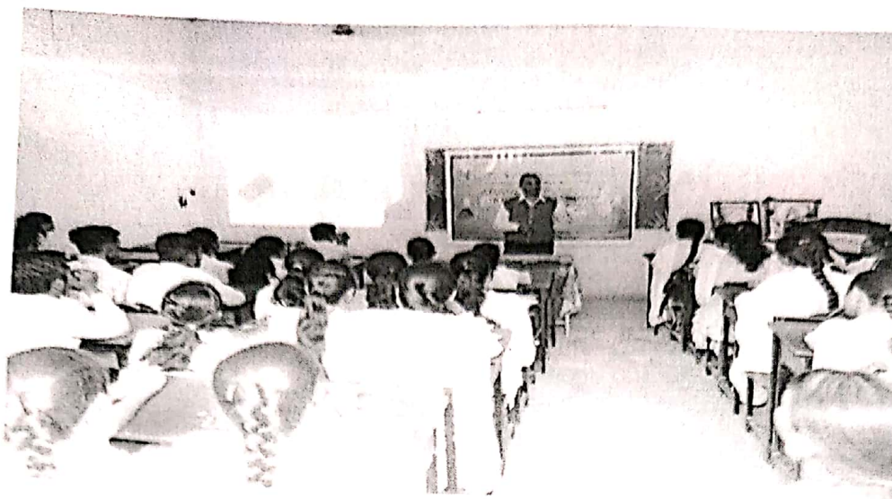
Interactive session with students