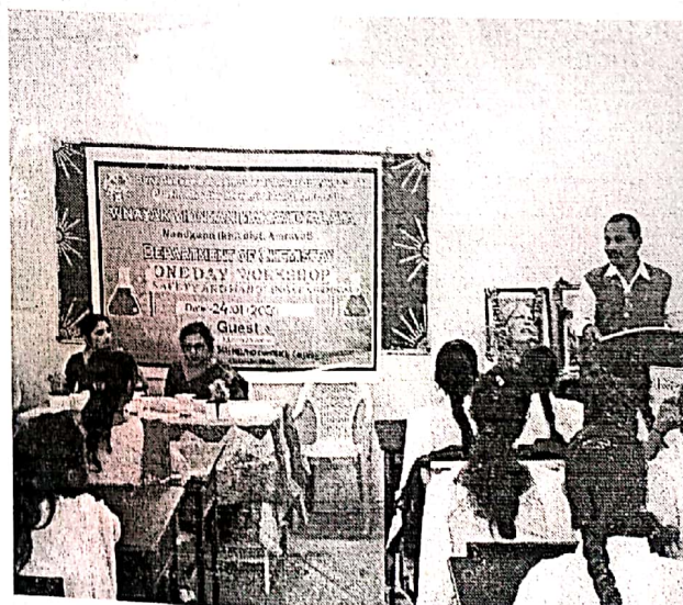
One Day Workshop organised by Department of Chemistry